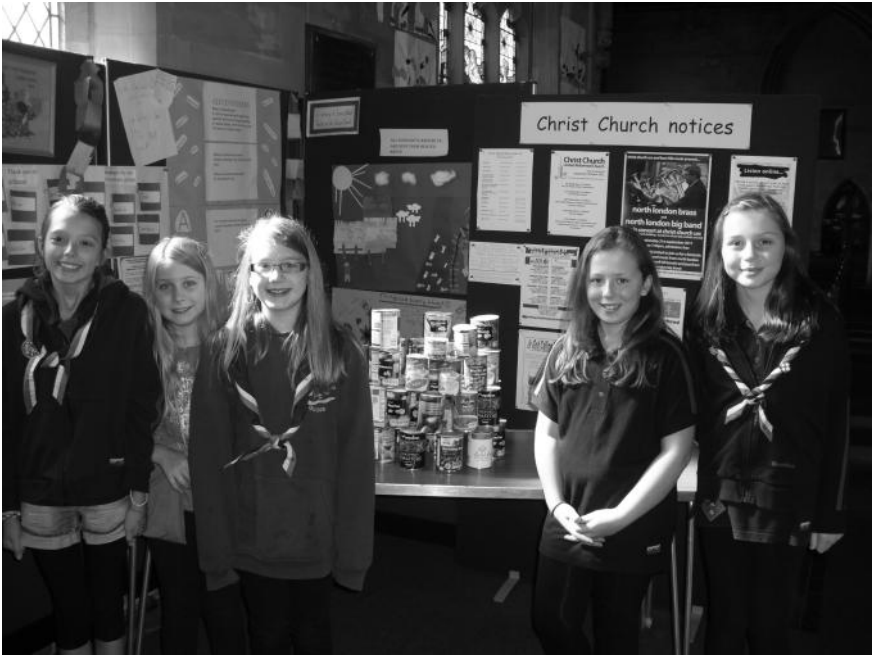
Above: Guides; Below: Rangers