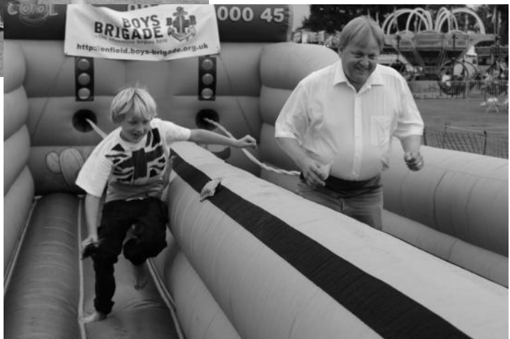
Right: fun on the bungee run at the BB/GB stand!