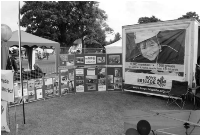
Left and below: the BB and GB stand at the show