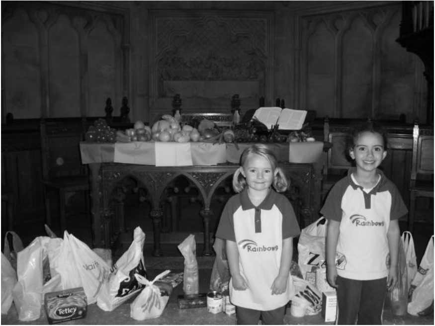
Above: Rainbows; Below: Brownies