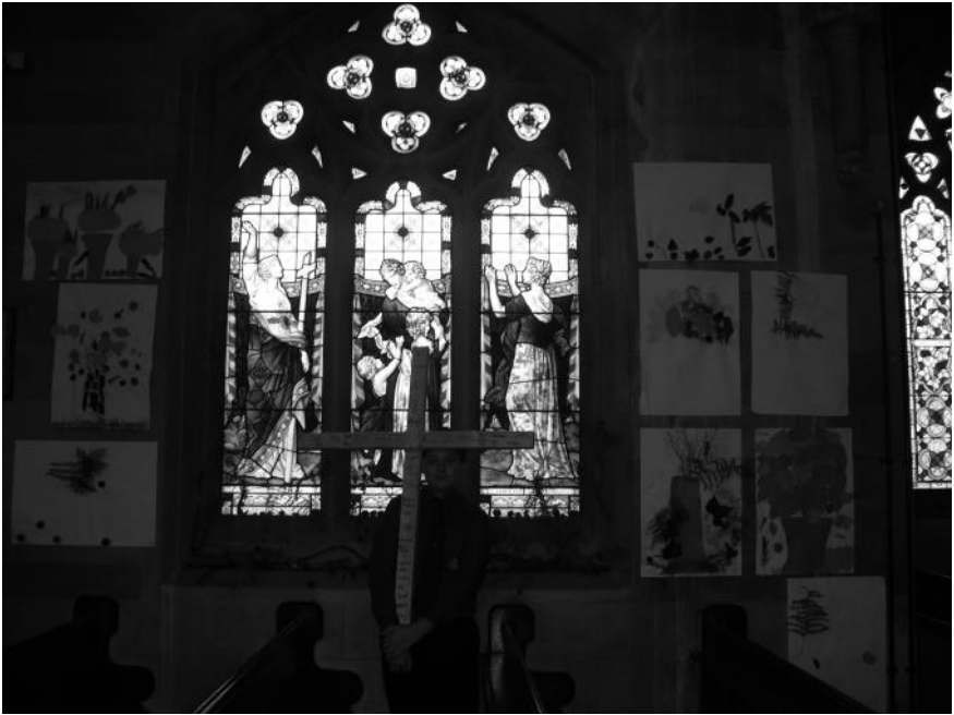
Above: Boys' Brigade