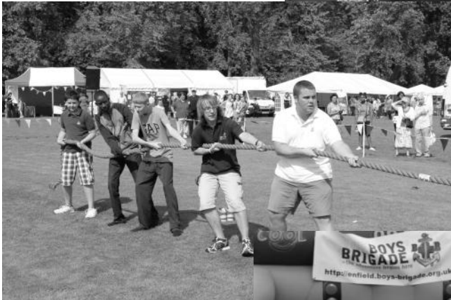
Left: the BB team in the YOU Enfield tug of war competition