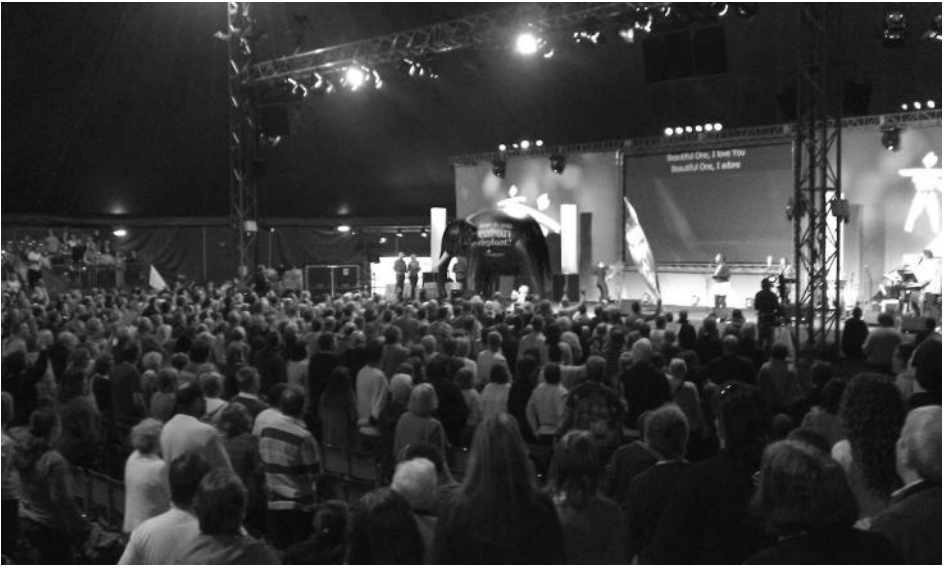
Evening worship in the big top at Spring Harvest 2011