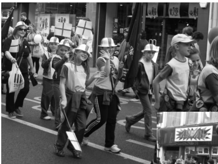
The Enfield St George's Day Parade on Sunday 17th April 2011

Members of our Rainbows, Brownies, Guides and Rangers took part in the parade through Enfield Town