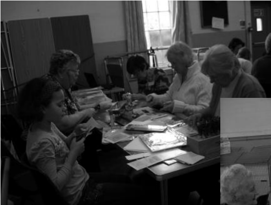
Right and below: more craft activities