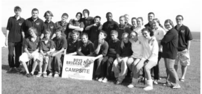
Summer Camp with the 10th Enfield to Beeston Regis, Norfolk, in 2009