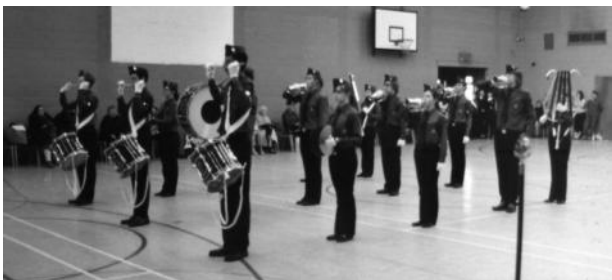
1st/3rd Enfield winning the Devonshire Cup in 2006

2002 saw the Centenary of Enfield Battalion, which was celebrated with a weekend of events in September. There were performances by the London Massed Bugle Band and the London Gym Team on the Saturday at the Enfield Town Show, and the Band was accommodated