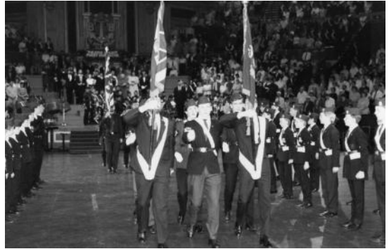
Colour Party at the very last Royal Albert Hall Display in 1987

After the BB centennial year the Company moved forward with its activities, new ventures like the Duke of Edinburgh awards were introduced. The Company entered the London District junior band competition for the first time in 1985 and won the title. The rules on the entries for The Daily Telegraph Shield competition were changed allowing for joint entries. In 1985 a combined team of the 1st and 3rd Enfield Companies entered the updated competition and won the competition. The Companies went on to win the competition a further three years. During this time a plaque was unveiled at St Paul Cathedral to Sir William Alexander Smith, very close to Lord Nelson's tomb. The 1st and 3rd provided the guard of honour for this event. The Companies also provided guard of honour for the final few Royal