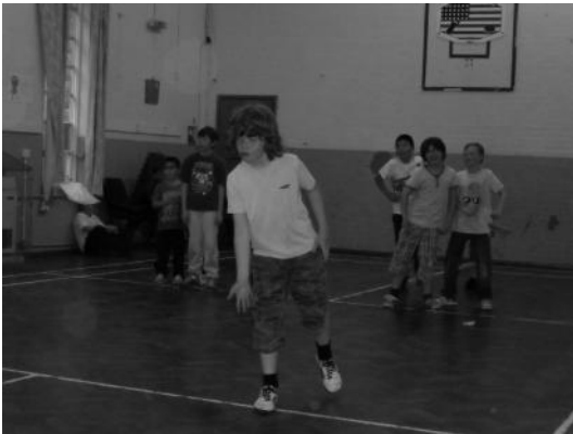
Games nights on Monday evenings in the Church hall