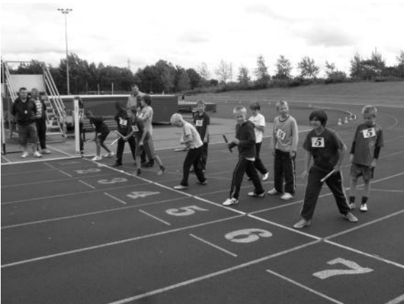
Taking part in the North London Zone Athletics competition at Pickets Lock Stadium